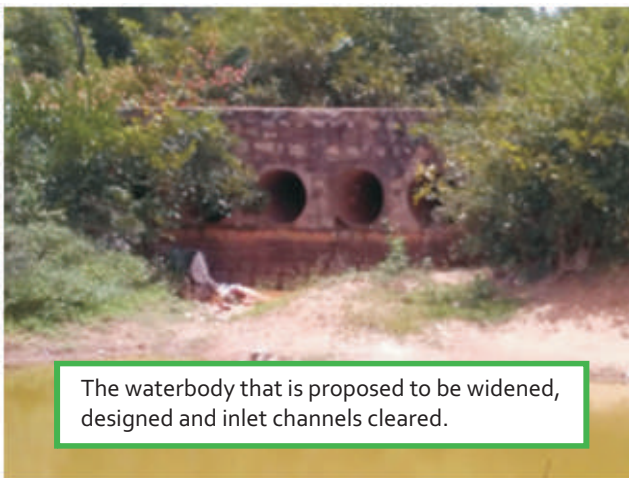
The waterbody that is proposed to be widened, designed and inlet channels cleared.

SPOP members have visited Kadisenahalli in the last couple of